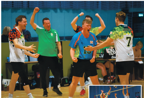
Above: The Guernsey celebrations begin after covering a match point in the men's A encounter.