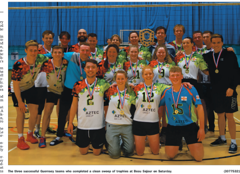
The three successful Guernsey teams who completed a clean sweep of trophies at Beau Sejour on Saturday. (30773321)

GUERNSEY'S six years of waiting for a women's inter-insular triumph came to a sweet end on Saturday. The team's men's A squad prepared themselves for a big day in the Sir John Loveridge Hall, even a few lucky glimpses from the public spectator area would tell us why.